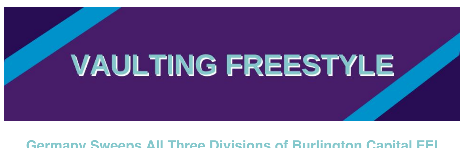
Germany Sweeps All Three Divisions of Burlington Capital FEI Vaulting World Cup<sup>™</sup> Final

Germany swept the board in all three divisions at the captivating Burlington Capital FEI Vaulting World Cup<sup>™</sup> Final at the CHI Health Center in Omaha, Nebraska. The Germans came into the second and final Freestyle round in pole position in all categories, and all three of their routines came up golden.