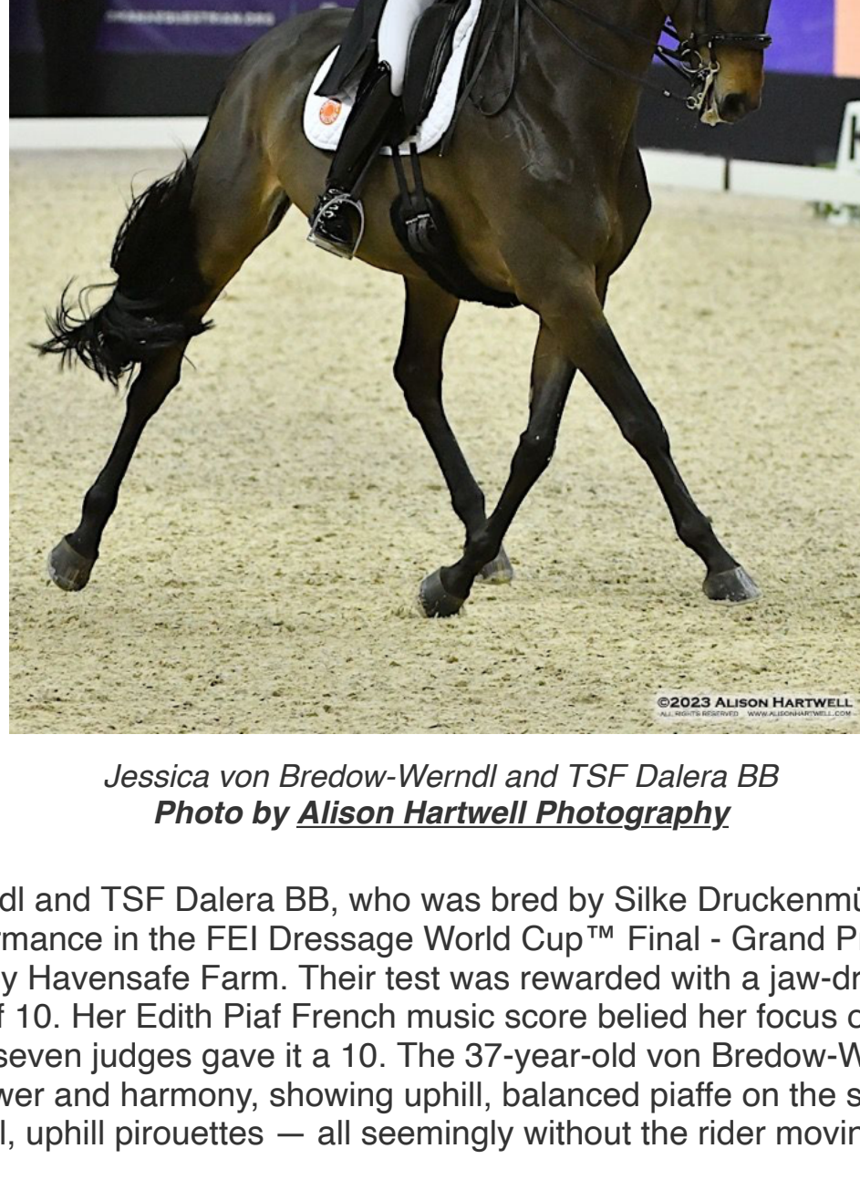
Jessica von Bredow-Werndl and TSF Dalera BB